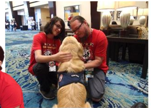
Please Pet Me