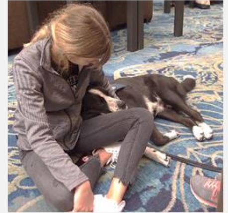
2019 TAPS Western Regional Military Survivor Seminar