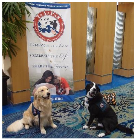
K9 Gummy Bear And K9 Jackson